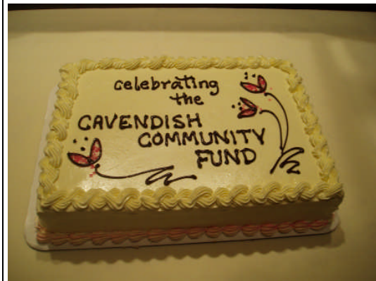
Guess who made the cake!

The Cavendish Community Fund officers and staff thank all individuals who attended the benefit dinner on August 1st at the Cavendish Inn for their generosity. The fundraiser was an unqualified success, both socially and financially. Attendees were treated to a wonderful dinner and even got to enjoy it outside on one of the nicest Saturday evenings in an otherwise wet summer. The goal of the dinner was to raise enough money to fund two rounds of grants, one in the fall and another next spring. We met the goal and can move forward with confidence in paying for more programs and events in the coming year.