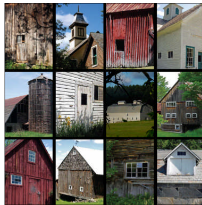
CCCA "Barns of Cavendish" Poster is on sale now just in time for the holidays.

New this year, CCCA has expanded the list of Cavendish based items that we offer with the inclusion of beautiful, full color note cards with pictures taken in Cavendish. These cards are perfect for your old-fashioned correspondence needs and as holiday gifts. There are dozens of delightful photos taken by our own Hans Schrag. These cards are available for purchase at Crows Bakery and Opera House Café on Depot Street in Proctorsville. Cards are $3.50 each and 4 for $12.00.