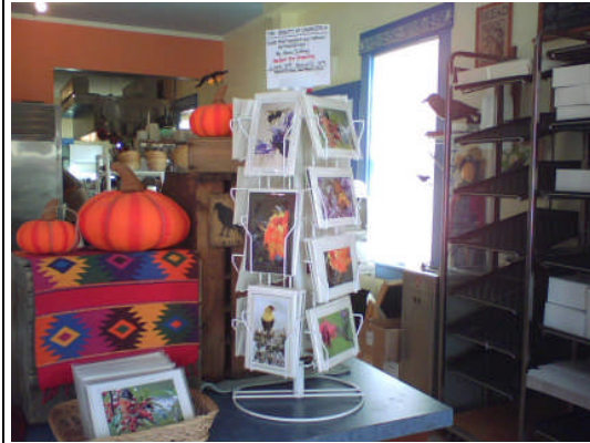
Display rack with Hans Schrag original Note Cards at Crows Bakery and Opera House Café.

New this year, CCCA has expanded the list of Cavendish based items that we offer with the inclusion of beautiful, full color note cards with pictures taken in Cavendish. These cards are perfect for your old-fashioned correspondence needs and as holiday gifts. There are dozens of delightful photos taken by our own Hans Schrag. These cards are available for purchase at Crows Bakery and Opera House Café on Depot Street in Proctorsville. Cards are $3.50 each and 4 for $12.00.