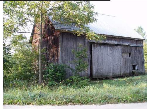
The Regier Barn on Quarry Road

Working with the CCCA Barn Preservation committee, Alan and Wendy Regier of Proctorsville have received a $10,000 grant from the Vermont State Historic Preservation office. According to the Barn Census done by the CCCA Barn Preservation committee, their barn is perhaps the oldest still standing in Cavendish. It is an English three bay barn with gable roof and eave entrance, built about 1800 for raising sheep, storing hay and threshing. It has hewn beams and chestnut gunstock posts that date it to that period. The Regiers will be accepting bids for repairing the stone foundation, the tamarack sills, and stabilization of the structure. The state requires that the Regiers match the grant and that the work be done this building season. Congratulations to the Regiers.