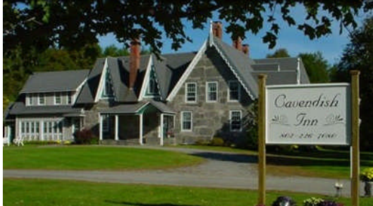
The Cavendish Inn